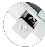
Mounting screw inside the product