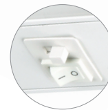
3 CCTs Switch